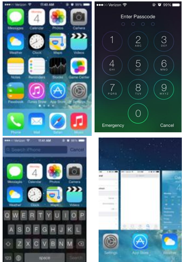
Screenshots of the new iOS 7 update.

Overall, iOS 7 is definitely worth the update, but if you have an iPhone 4, I suggest waiting a little and deciding whether the jump to Apple's new iOS is really worth it. For iPhone 4s users and later, iOS 7 is a definite improvement the previous iOS 6.