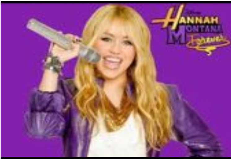
Miley Cyrus when she was on Disney channel as Hannah Montana

Something Miley Cyrus has done for people with cancer, is she cut her hair and donated it to charity for cancer. According to an anonymous user at Teen.com "Miley Cyrus donated her hair to a Cancer charity. And you're calling her "ugly". Trust me, she's more beautiful than you. Make a change.