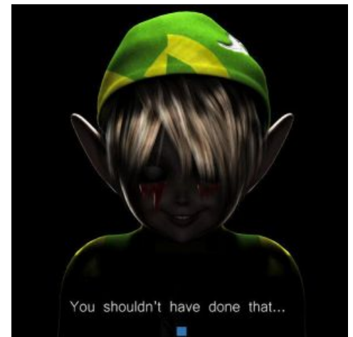
A character being pastiest by creepypasta

"Creepy, just creepy," said 8th grader Kaitlin Ashford.