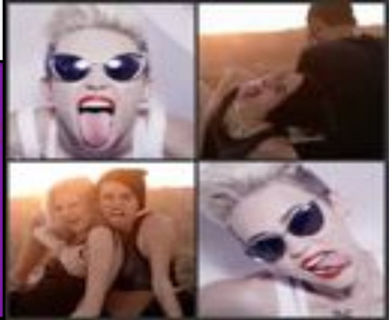
The way Miley Cyrus looks now that she's 20