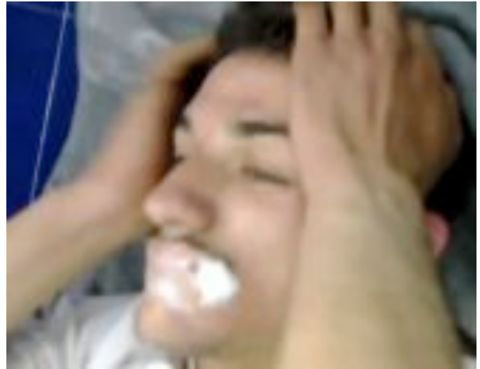
Victim of Sarin Gas in Syria

The Organization for the Prohibition of Chemical Weapons, winners of the Nobel peace prize this year, sent inspection teams to Syria starting the second week of October. They are currently in the process of destroying the chemical weapons and the machines that create them.